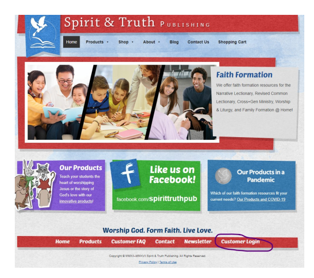
Step 1: All pages on our website will have a red ribbon at the bottom (footer). On the right side of this ribbon is the white text "Customer Login." Click this text to enter your Customer Account.